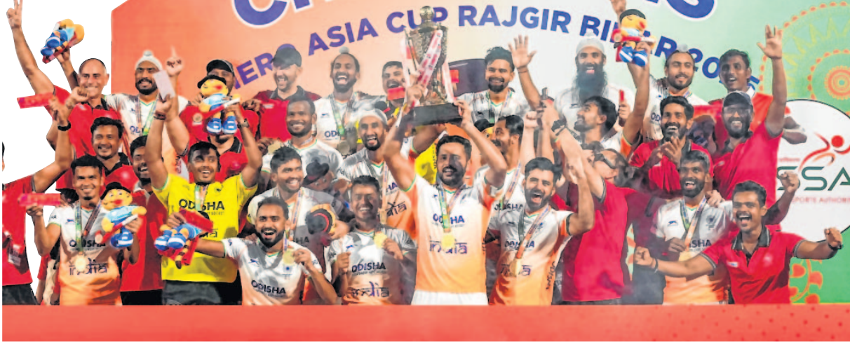
Crown of Rajgir India's captain Harmanpreet Singh proudly lifts the glittering trophy as jubilant teammates celebrate their triumph over Korea in the men's Hockey Asia Cup 2025 final at Rajgir on Sunday PTI

7-0 Biggest win in Super 4s: India 7-0 vs China India started with fire as Sukhjeet Singh netted in the