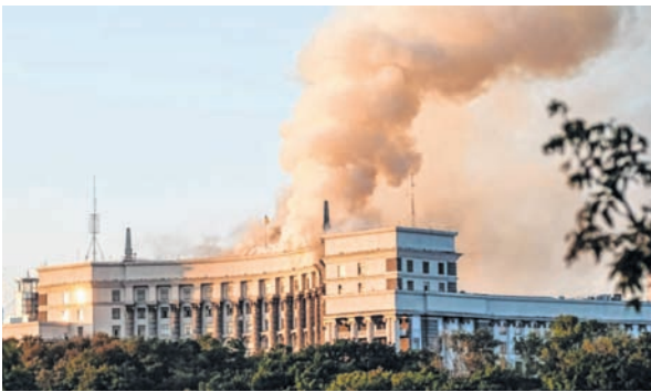
Smoke rises from a building of Ukrainian government headquarters, after Russian drone and missile strikes, amid Russia's attack on Ukraine, in Kyiv, on Sunday

Associated Press reporters saw a plume of smoke rising