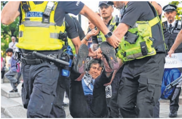
Police officers remove an agitator from the protest site during a stir to support Palestine Action in London